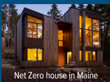
Net Zero house in Maine

As long-standing members of the United States Green Building Council, we have been committed to sustainable design since day one. Eight of our projects have received LEED certification. In 2019 we joined the AIA 2030 Challenge (a voluntary program to encourage, support, and monitor the sustainability of architecture projects). In 2020 we were recognized for reaching the initial 70% energy reduction goal—a milestone that only 15% of the participating firms achieved. In 2023 we also joined BE+ and NESEA.